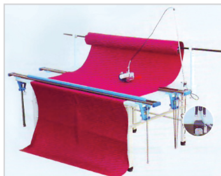
Cutting Table and Accessories are sold separately