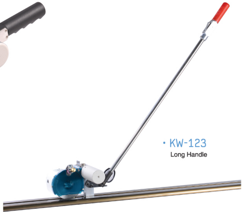
• KW-123 Long Handle