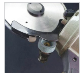
Built-in Sharpening Device