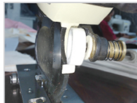
Built-in Sharpening Device