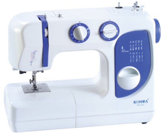
• KW-621 with Hard Plastic Cover