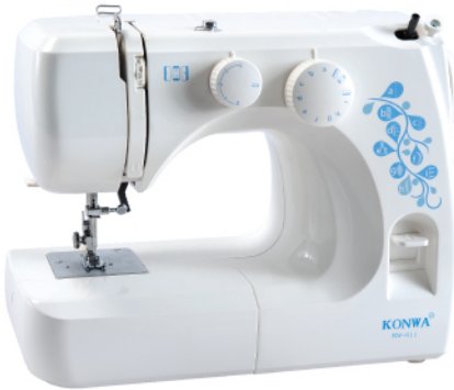
• KW-611 with Soft Plastic Cover

Multi-Purpose Portable Domestic Sewing Machine with One Step Buttonhole