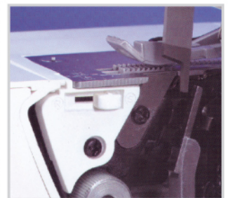
Easy rolled item change over