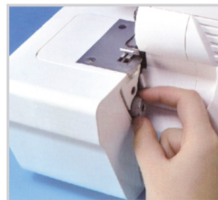
Adjustable cutting width