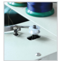
Built In Bobbin Winder (for Single Head Machine only)

Konwa brand multiple heads electronic embroidery sewing machines are being used by numerous export factories throughout Malaysia.