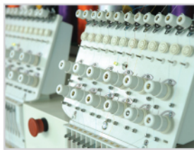
Thread Detector Sensor